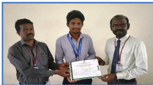
Anna University Zonal Winner- 20 KM Walk