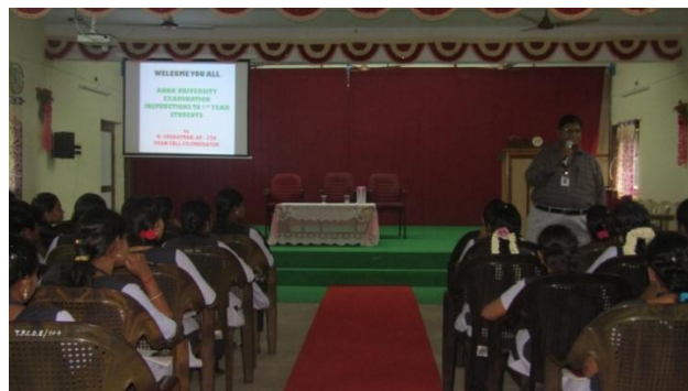
Anna University Examination Instructions