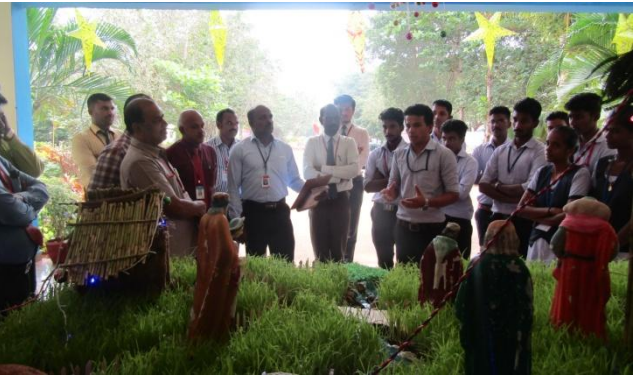
Evaluated by JP Group Principal's