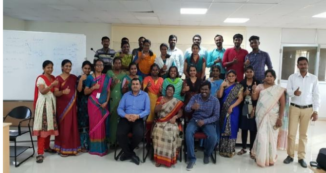
Three day Seminar - CSE staff