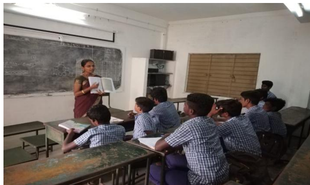
Guest Lecture for school students