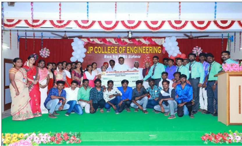
Crib Competition - I Prize (Rs.5,000) EEE Department