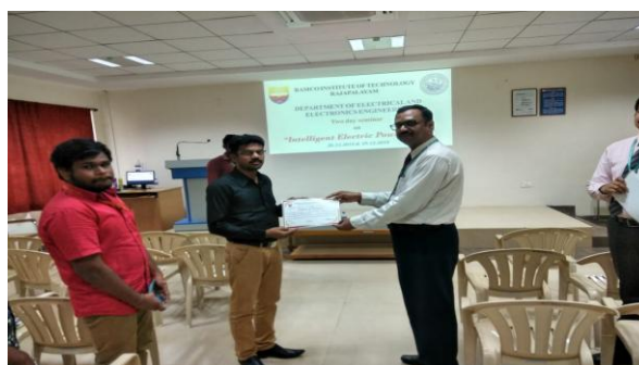
Two day Seminar - EEE staff