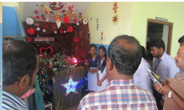
Evaluated by JP Group Principal's