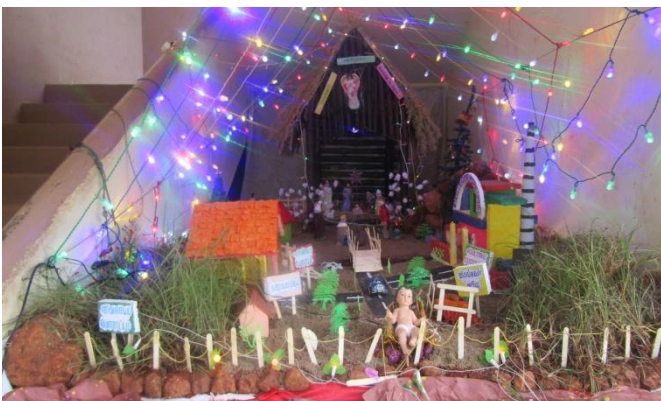
ECE - CRIB