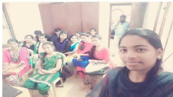
IPT at INetz Techno Solutions– III Yr. CSE