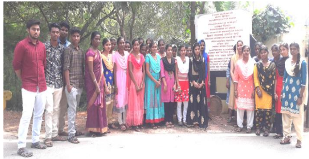
Industrial Visit at ISRO- II Yr. ECE