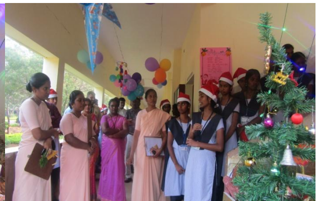
Evaluated by JP Group Sister's