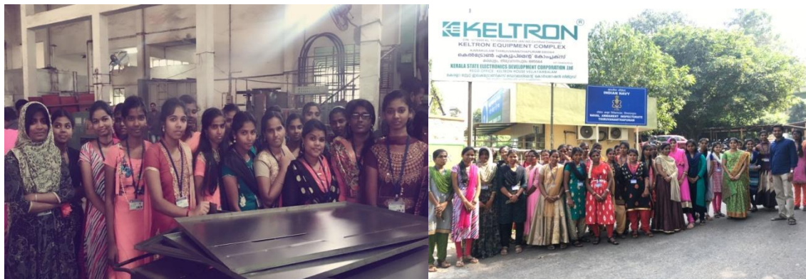
Industrial Visit at KELTRON– III Yr. ECE