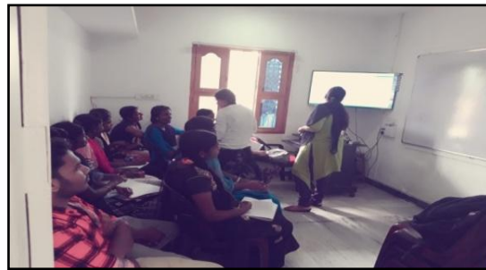
IPT at UNIQ Technology – II Yr. CSE