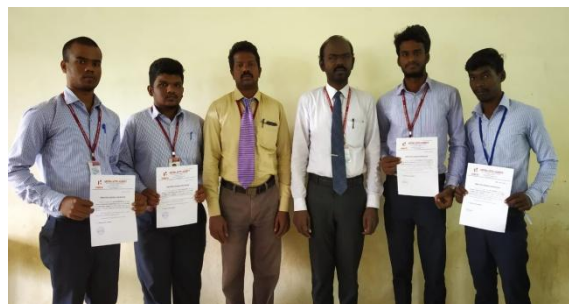
IPT at Aruna Auto Agency –II Yr. MECH