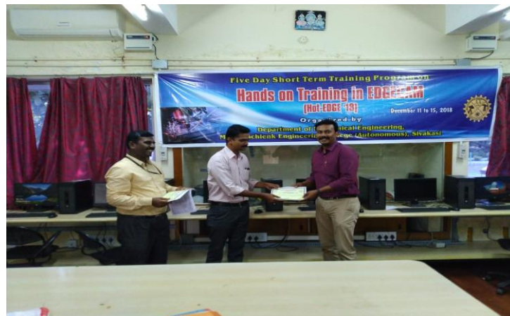
Five-day hands-on training- Mechanical Staff