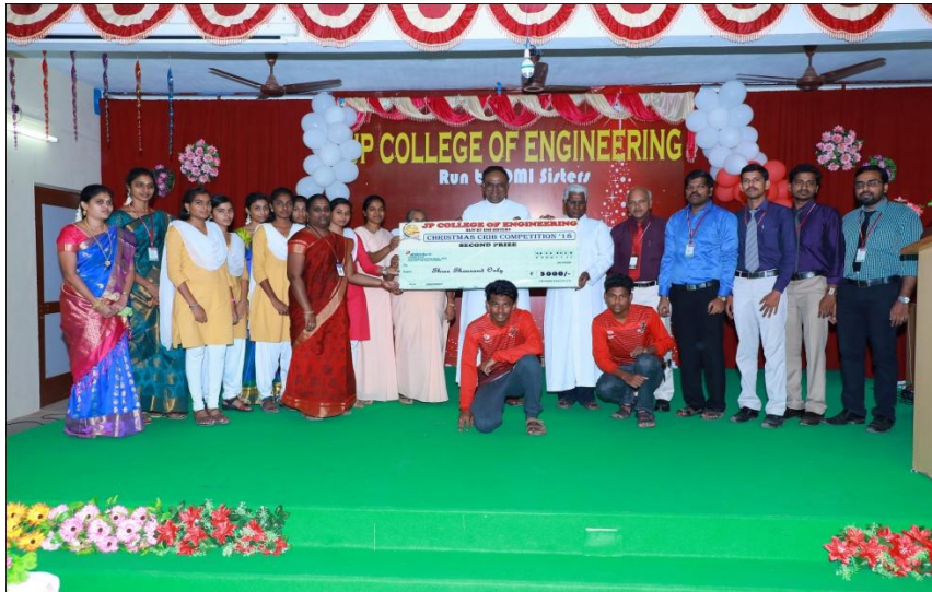
Crib Competition - II Prize (Rs.3,000) ECE Department