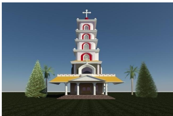
3D model by Mohammed Ismail, III rd Year Civil