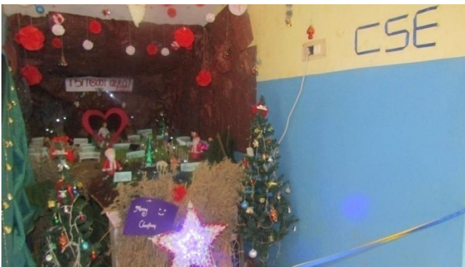
CSE - CRIB