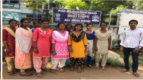
IPT at AIR – II Yr. ECE