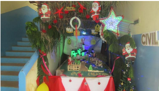
CIVIL - CRIB