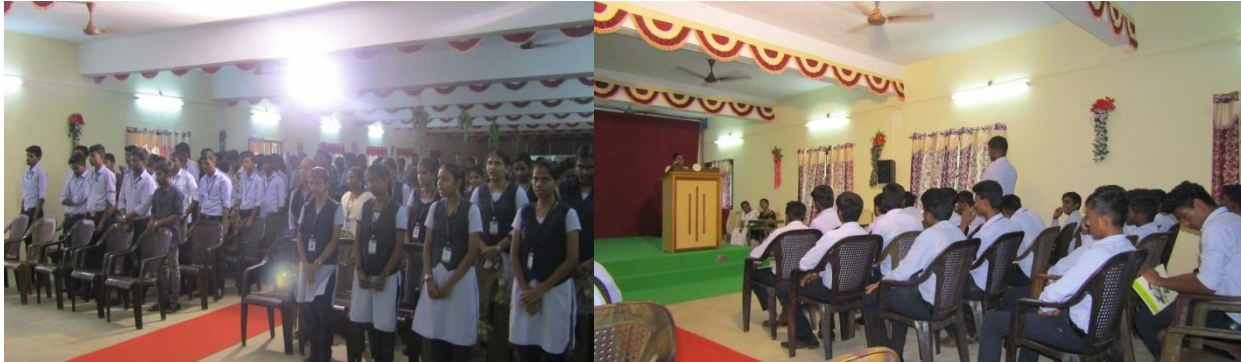
Exam Prayer and Motivation talk