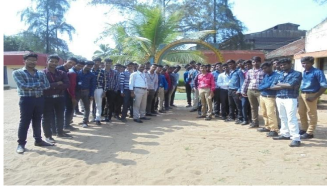
Industrial Visit at AUTOKAST – II Yr. MECH