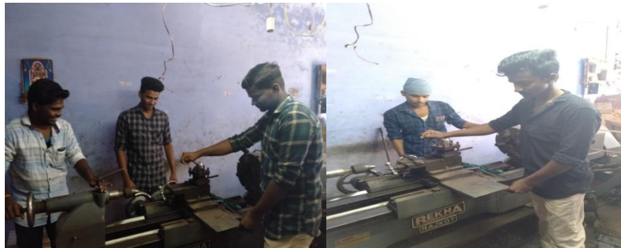
IPT at Rewinding centre –II Yr. EEE