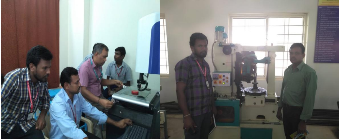
Two-day hands-on training- Mechanical Lab technician