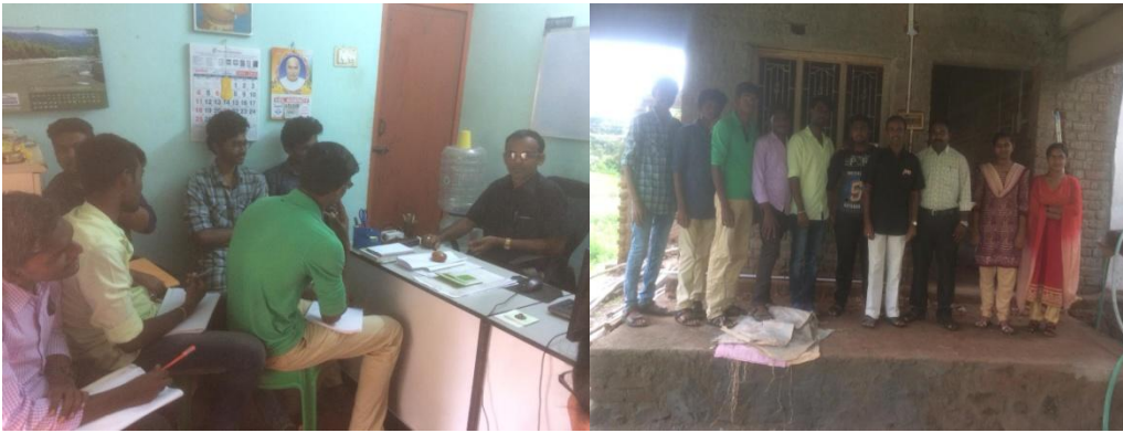
IPT at Vino Builders – II Yr. CIVIL