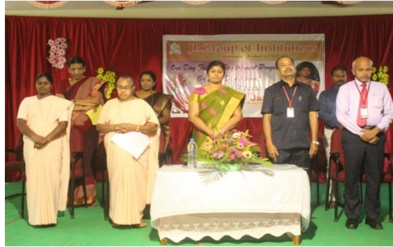
Faculty development program