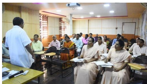
Meeting at DFT