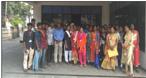
Industrial Visit at SPECTRUM – II Yr. CSE