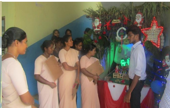
Evaluated by JP Group Sister's