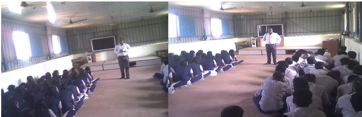
Motivational talk for school students