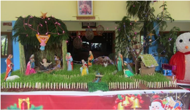
MECHANICAL - CRIB

➤ Crib Competition was conducted for Christmas day celebration on 19 th December , 2018