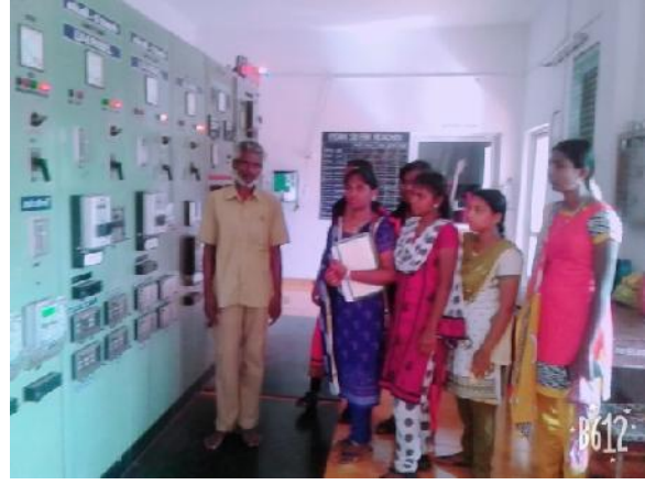
Students with Trainer