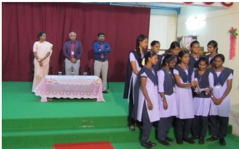
Prayer song sung by student choir