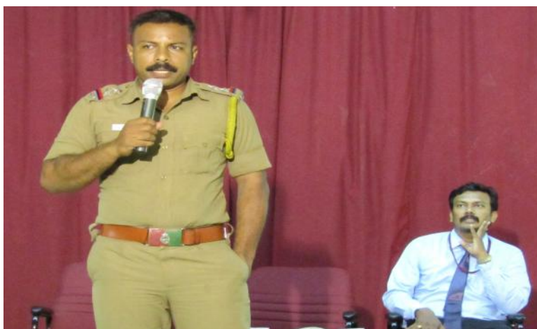
Sub-Inspector delivers speech