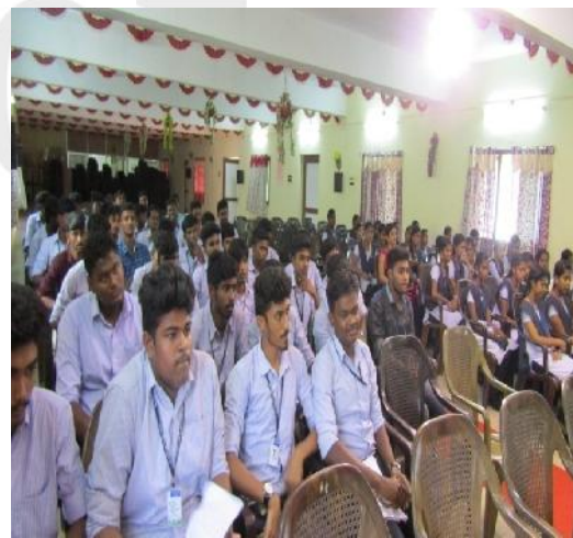
Assembly Prayer at College Auditorium with the students participated