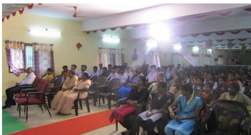
Participation of Representatives from Management, Teaching, Non-teaching and Students