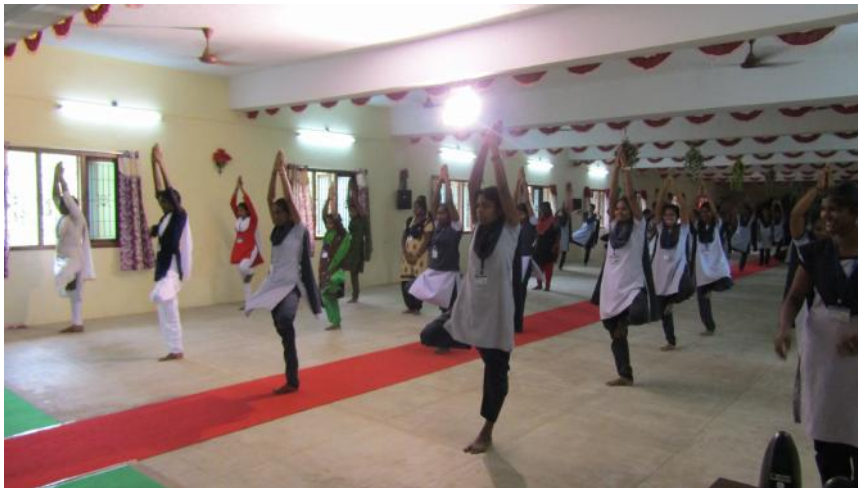
Students perform Yogasanas