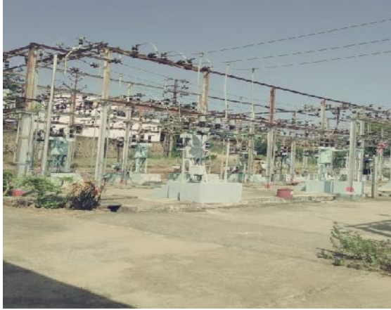
110kv Tenkasi Station