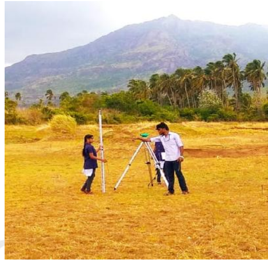
Students in the field work