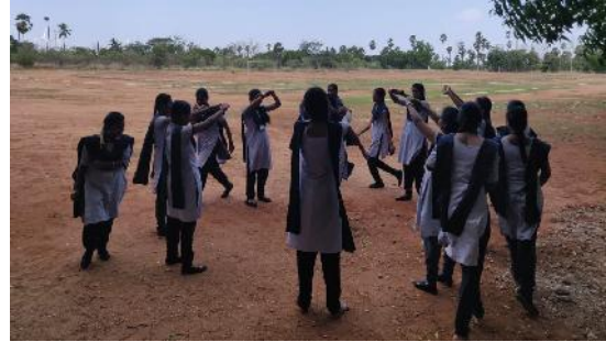
Students taking part in various games