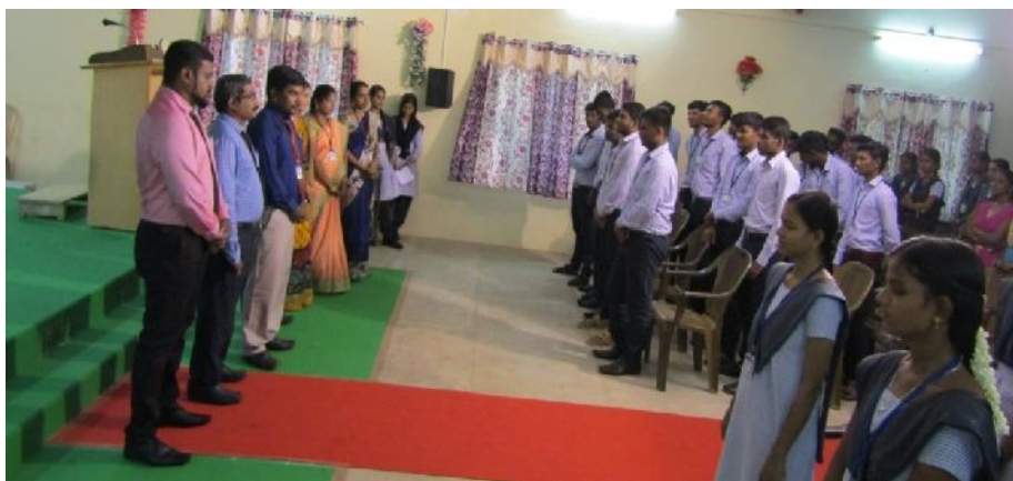
Assembly Prayer at College Auditorium