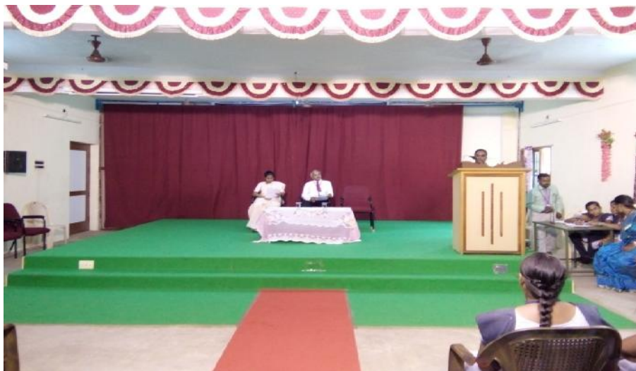
Assembly prayer at College Auditorium