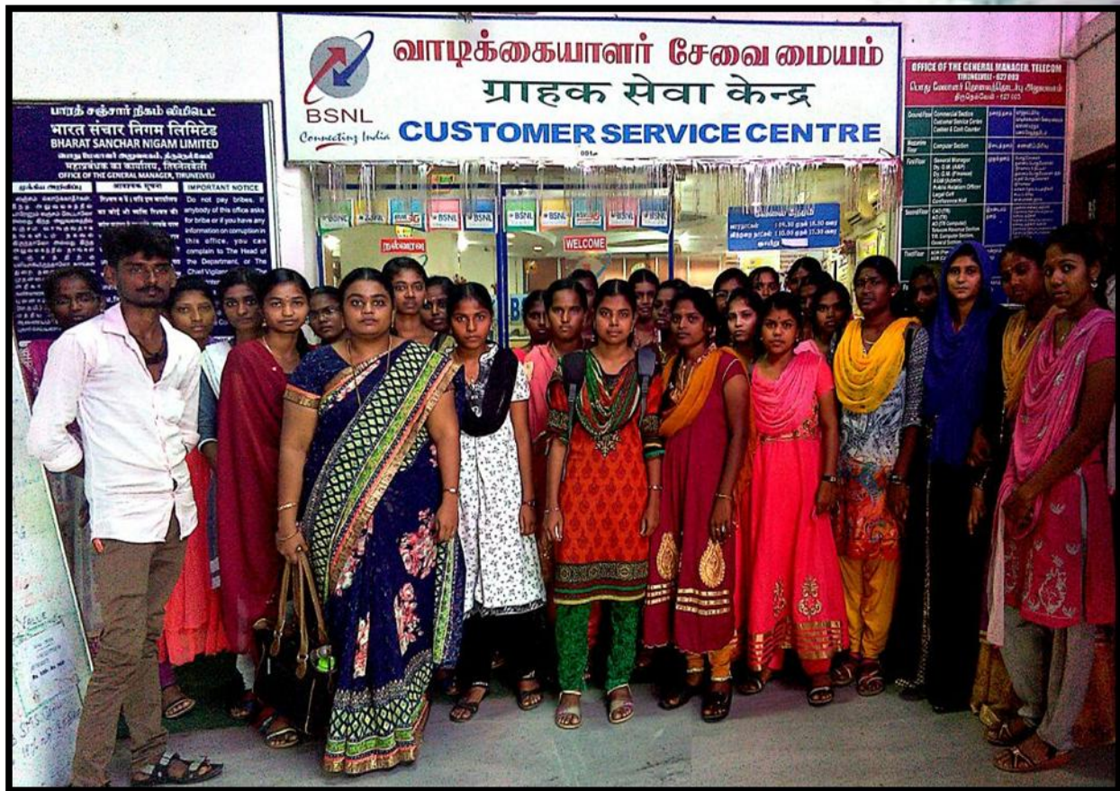
Second year ECE Students In-plant Training at AIR, Tirunelveli

The students were attended the In-plant training in BSNL, AIR, ECCI, UNIQ at Tirunelveli. The students were received certificates for their participation in In-plant training.