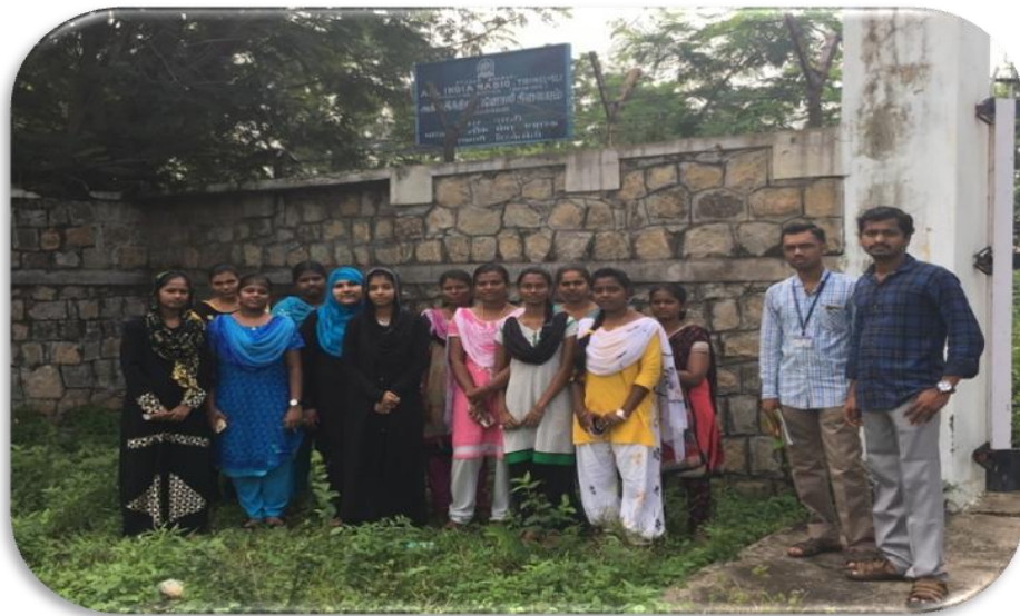
Third year ECE Students In-plant Training at AIR, Tirunelveli